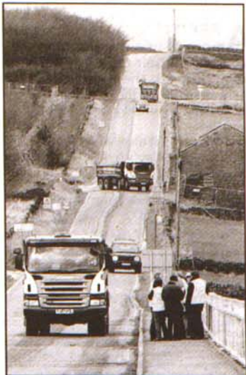
■ BUSY CROSSING: Quarry lorries at Scammonden’s Brown Cow Bridge also pictured, above left, spanning the M62